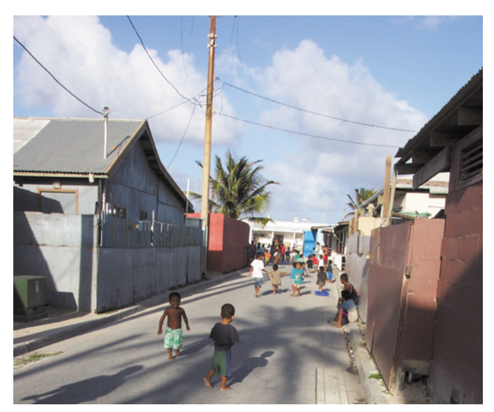
Ebeye, Republic of the Marshall Islands

The six jurisdictions—the U.S. flag territories of American Samoa, the Commonwealth of the Northern Mariana Islands (CNMI), and Guam, and the independent countries, "freely associated with the United States," of the Federated States of Micronesia (FSM, including Chuuk, Kosrae, Pohnpei and Yap), the Republic of the Marshall Islands (RMI), and the Republic of Palau—have both an economic and political relationship with the United States. A trade partner since the mid-19<sup>th</sup> century, the United States today serves as the region's primary funder of social and health services as well as its United Nations-recognized "trust administrator." Acknowledging these strong connections, the Institute of Medicine in 1998 examined health