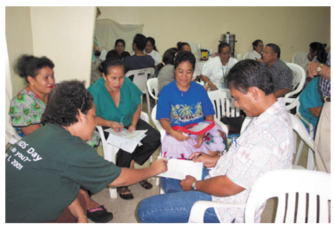
PICCEP course, Pohnpei, FSM